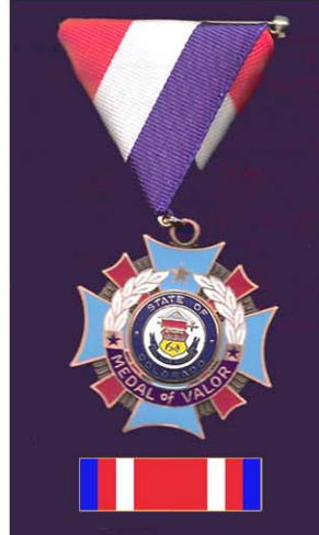
Medal of Valor with Ribbon