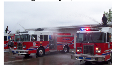
A Wetting Ceremony was held to christen the new apparatus and as a welcome to the fleet.

Smeal Pumper that is housed at Station 53 (120th and Buckley). The pumper holds 1000 gallons of water and has a 1500 gpm pump. The $356,000 apparatus was delivered in April and was put into service on the evening of May 8, 2008.