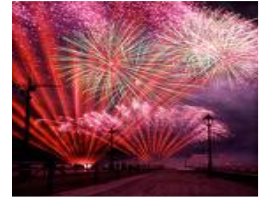
In 2006 there were 9,200 injuries and 11 deaths from unsafe use of fireworks..

If you plan on having a 4th of July celebration that includes fireworks, please be safe. Keep in mind that the City of Brighton has an ordinance that any fireworks that leave the ground or include a report (pop/bang) are unlawful. Children should be at a safe distance while fireworks are being ignited; and NEVER let children use lighters or matches to light fireworks, no matter how responsible you think they are.